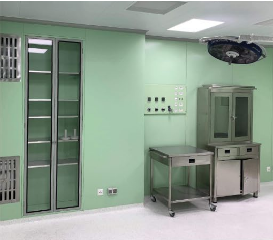
Implementation of clean rooms in the private clinic VERUM in Kyiv