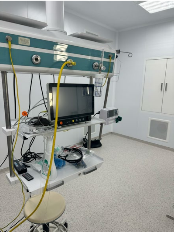
Production and installation of medical gas systems in the NOVA medical center in Kyiv