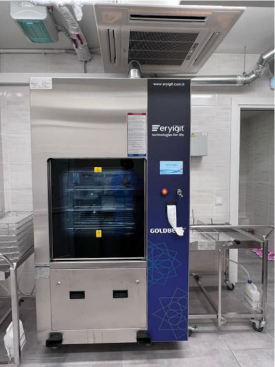
The central sterilization department in the MEDICOM medical center in Kyiv