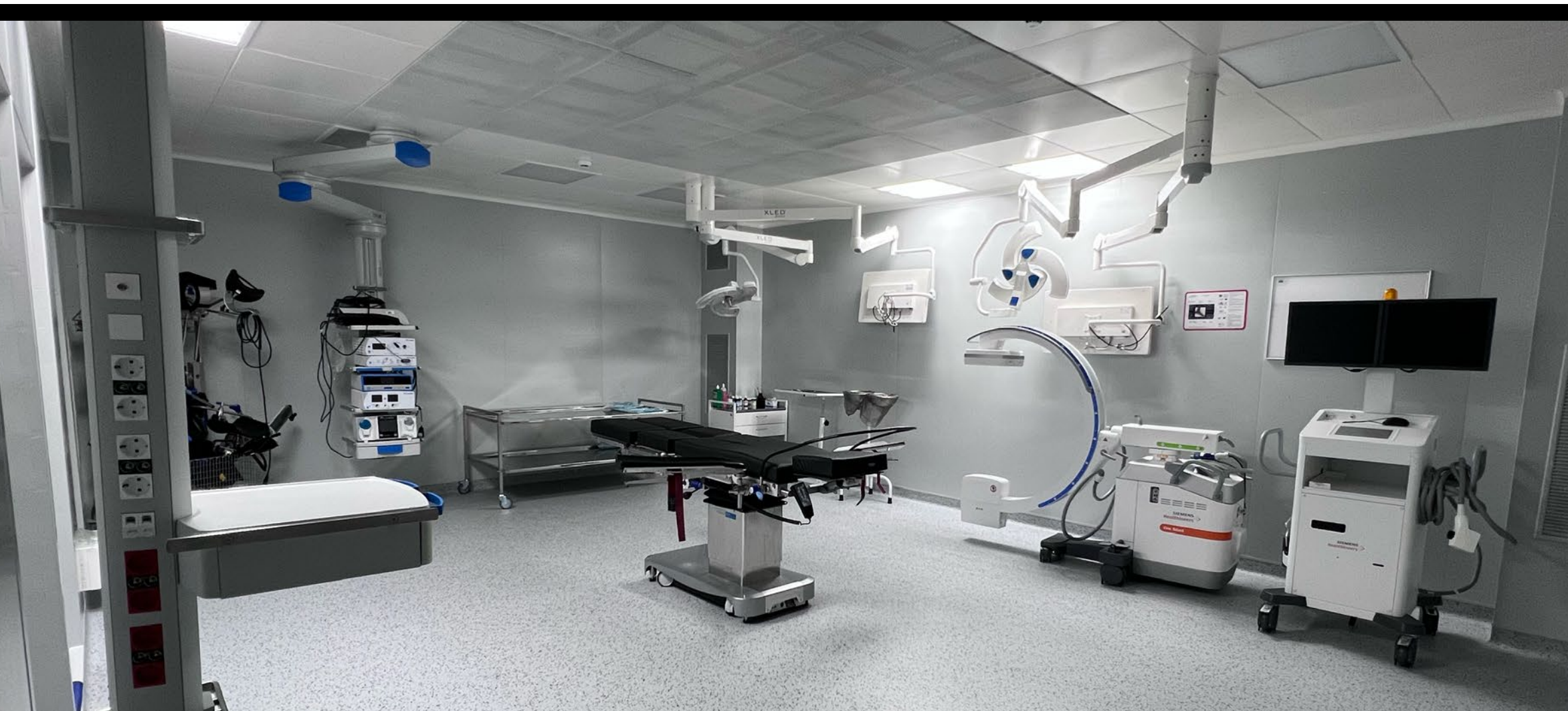
Planning and equipment of the private clinic MIRUM in Kyiv